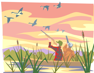
Hunter Safety To Be Offered in Sept.