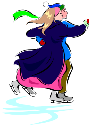
WINTER AWARDS BANQUET SCHEDULED FOR SATURDAY JANUARY 17, 2009

trance to the clubhouse when the building is open or placed in boxes in the rifle range or Muzzle-loading building. Not all awards have to be of a serious nature. Think back on events that you participated in during the past year. Maybe someone de-